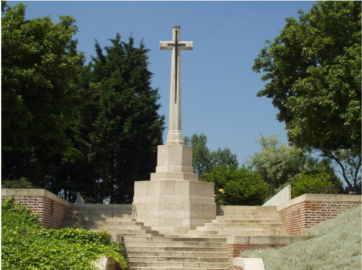
Athies Cemetery Communal Extension – Pas de Calais