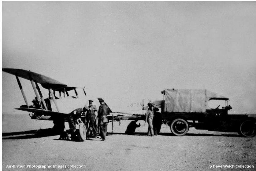
Servicing a plane at RAF Abu Sueir