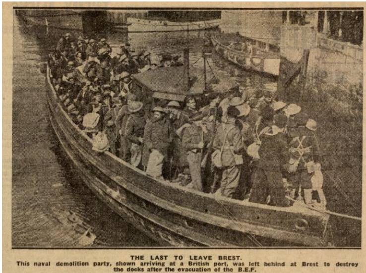
'The last to leave Brest'