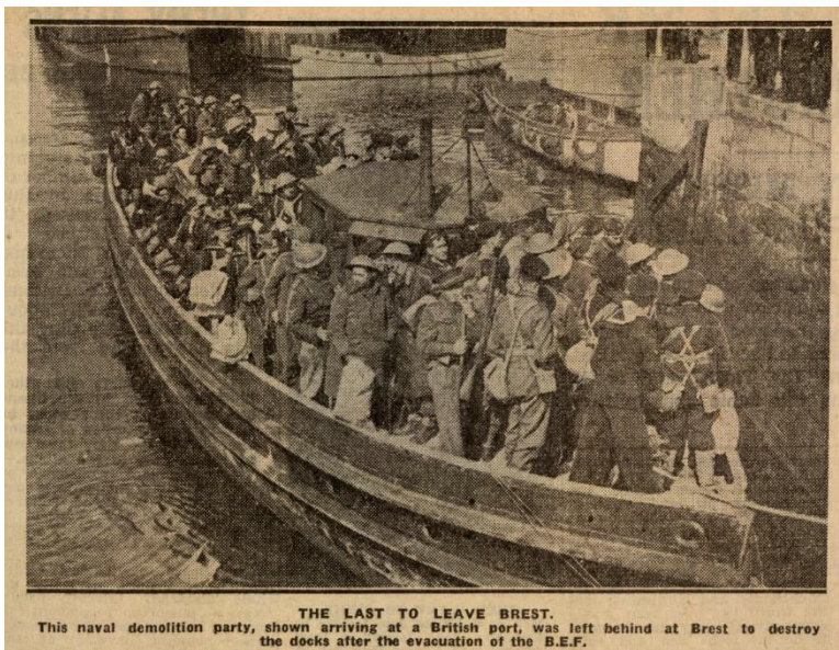
THE LAST TO LEAVE BREST. This naval demolition party, shown arriving at a British port, was left behind at Brest to destroy the docks after the evacuation of the B.E.F.